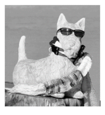
Town Mascot, Beloved by all. Please return to beach!